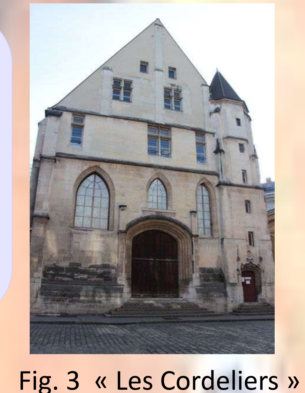
One of the site of the Paris-V French Faculty of Medicine

Public meetings in the French Parisian historical site of "Cordeliers". Same place as for French Surgery Academy. Two meetings devoted to animal welfare per year. Private meetings and work in the building of the NCVS.