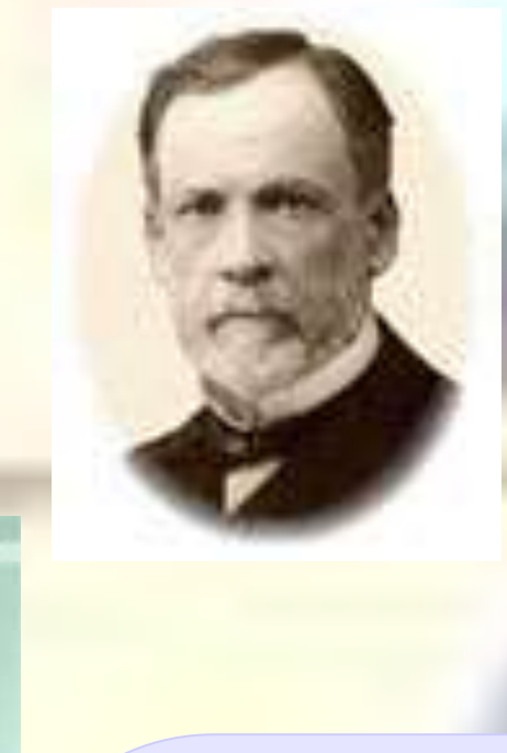
Fig. 2 Some famous members of the FVA: veterinarians or non veterinarians